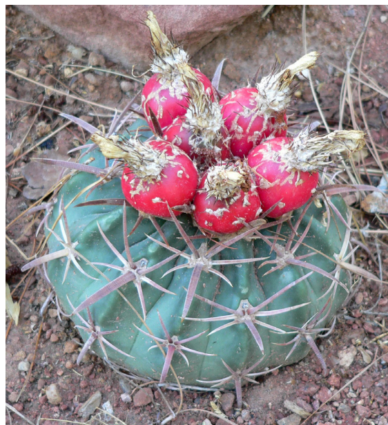
Figure 3. Echinocactus texensis Hopff., showing the tuft-like spines and the reddish fruits.

The species of Cactaceae that served as the inspiration for Togemon is the horse creeper cactus, aka devil's pincushion or by its scientific name Echinocactus texensis (DigimonWiki, 2023a). Echinocactus texensis is a succulent subshrub species endemic to Northern Mexico and central-southern United States (New Mexico, Oklahoma, Texas) (POWO, 2023).