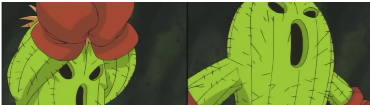
Figure 2. Togemon uses its special attack Needle Spray against its opponent.

( Lilium spp.). Other forms are Togemon X and Ponchomon. Togemon X looks like Togemon but wears a poncho (a Mexican-style dress) and a sombrero, and carries the so-called X-Antibody (DigimonWiki, 2023b). Ponchomon is a ghost-type Digimon which is rumored to appear when a Togemon has died due to unforeseen circumstances (DigimonWiki, 2023c). Ponchomon looks like Togemon X but has no feet (it is a flying ghost) and still wears the poncho (hence its name) and sombrero.